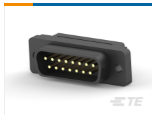
TE Part # CAT-AM7-H3 IDC D-Sub: Plug Assembly, Low Profile, Signal, 2.77 mm