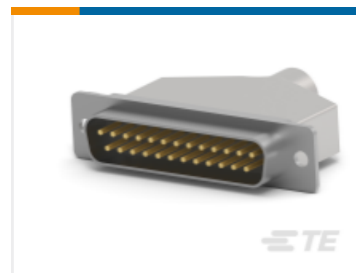
TE Part # CAT-AM7-248H4 IDC D-Sub: Connector Kit, Plug, Wire to Wire, Signal, 2.77 mm