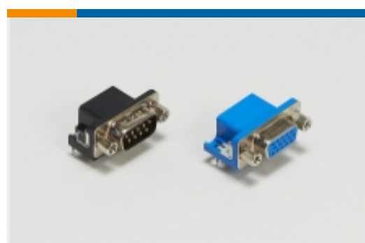
PCB D-Sub Connectors(354)