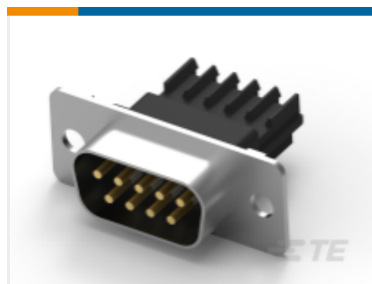
TE Part # CAT-AM7-248H3 IDC D-Sub: Plug Assembly, Wire to Wire, Signal, 2.77 mm