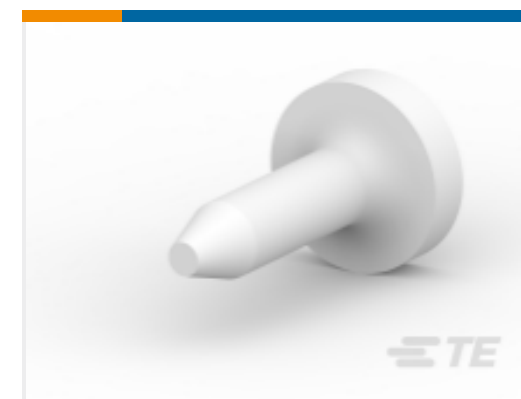
TE Part # 206509-1 SIZE 20 KEYING PLUG